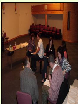
Sidewalk Volunteers Training (Oct 2009)