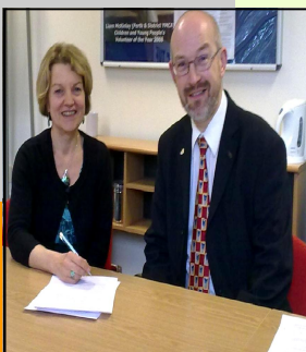
The Sidewalk Management group sign the Faithworks charter, March 2010