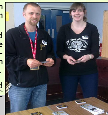
Sidewalk at the Driving ambition Roadshow (June 2010)

June 2010: Met and engaged with many young people at Transition days and Driving Ambition Events. We sponsored an Award at the Spirit of Youth Awards and started lunchtime work in Perth Grammar school.